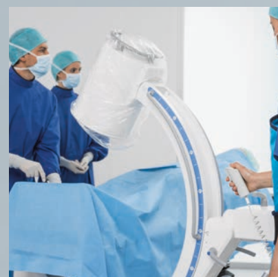
Simply push the release button for standard image acquisition