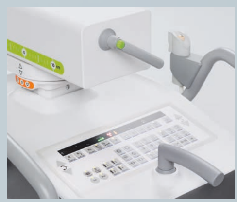
Robust system design in every detail: the control panel and keyboard are waterproof and easy to clean