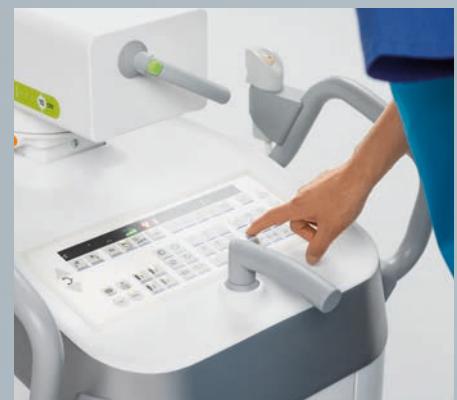
Buttons are grouped in a workflow-oriented way