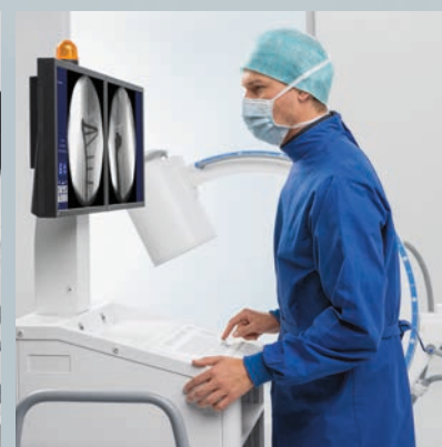
With IDEAL dose management, you benefit from high image quality at the lowest possible dose