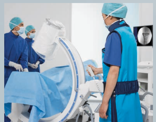
Thanks to its advanced CCD camera and optics, Cios Select delivers sharp images at high resolution