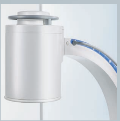
Proven image intensifier technology makes Cios Select a smart and reliable choice