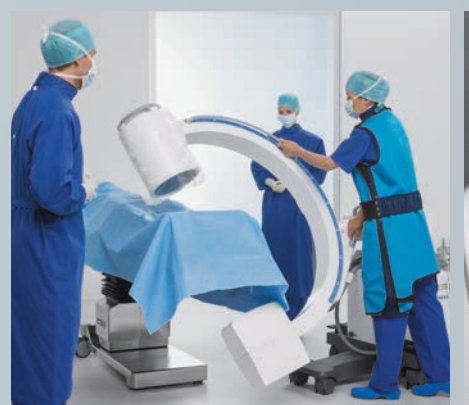
Cios Select is a robust mobile C-arm characterized by high system availability and low maintenance