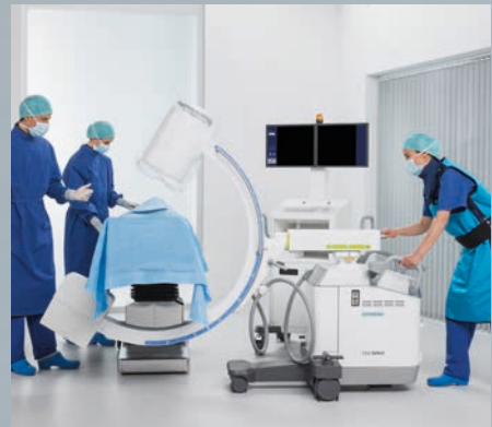
Easy and precise C-arm positioning with color-coded axes and brakes