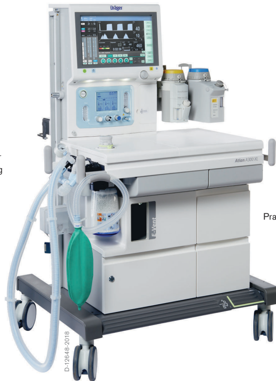
Atlan® A300 XL

Large work surface, lockable drawer and additional shelves (optional) for optimal working conditions and supplies storage