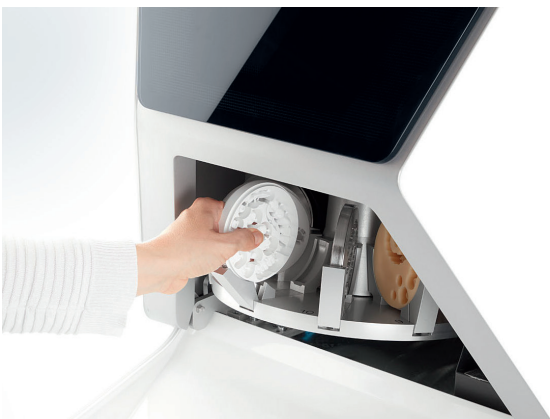
One-handed clamping made possible by DirectDisc Technology